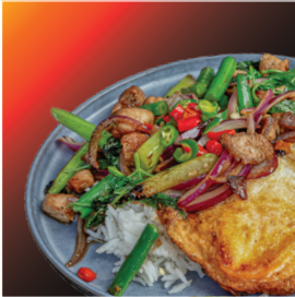
Pad Ka Prow