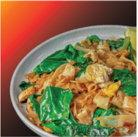
Pad See You